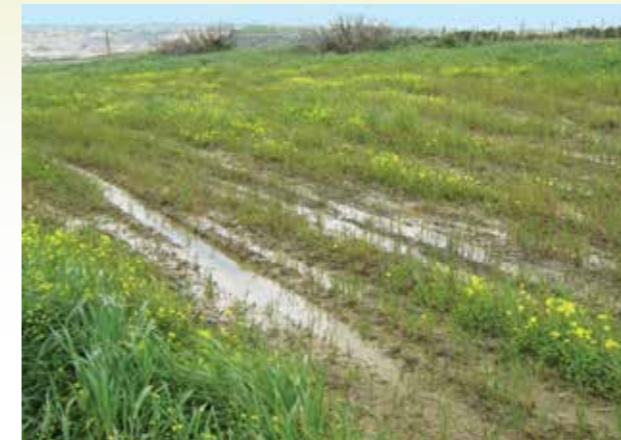
✗ Example of use of bulky machinery when the soil is flooded