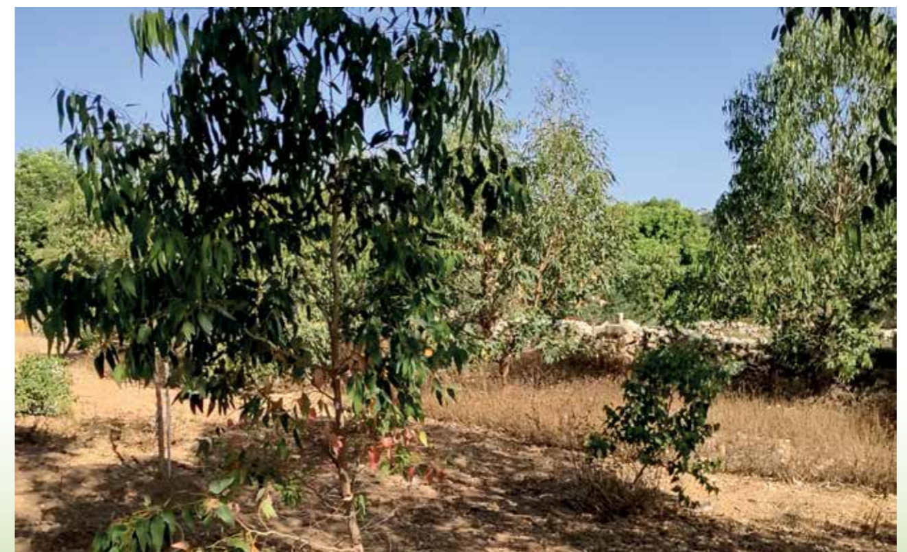
✘ Example of spreading of an invasive tree species (Eucalyptus)