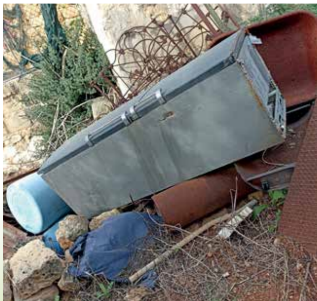
✘ Examples of waste on parcels