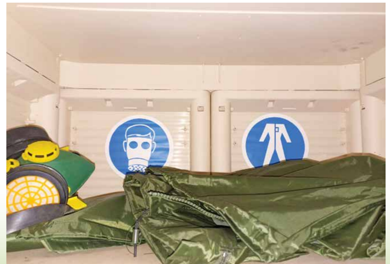
✓ Example of well-stored Personal Protective Equipment (PPEs), (face mask, gloves and protective overall), clean from residues.