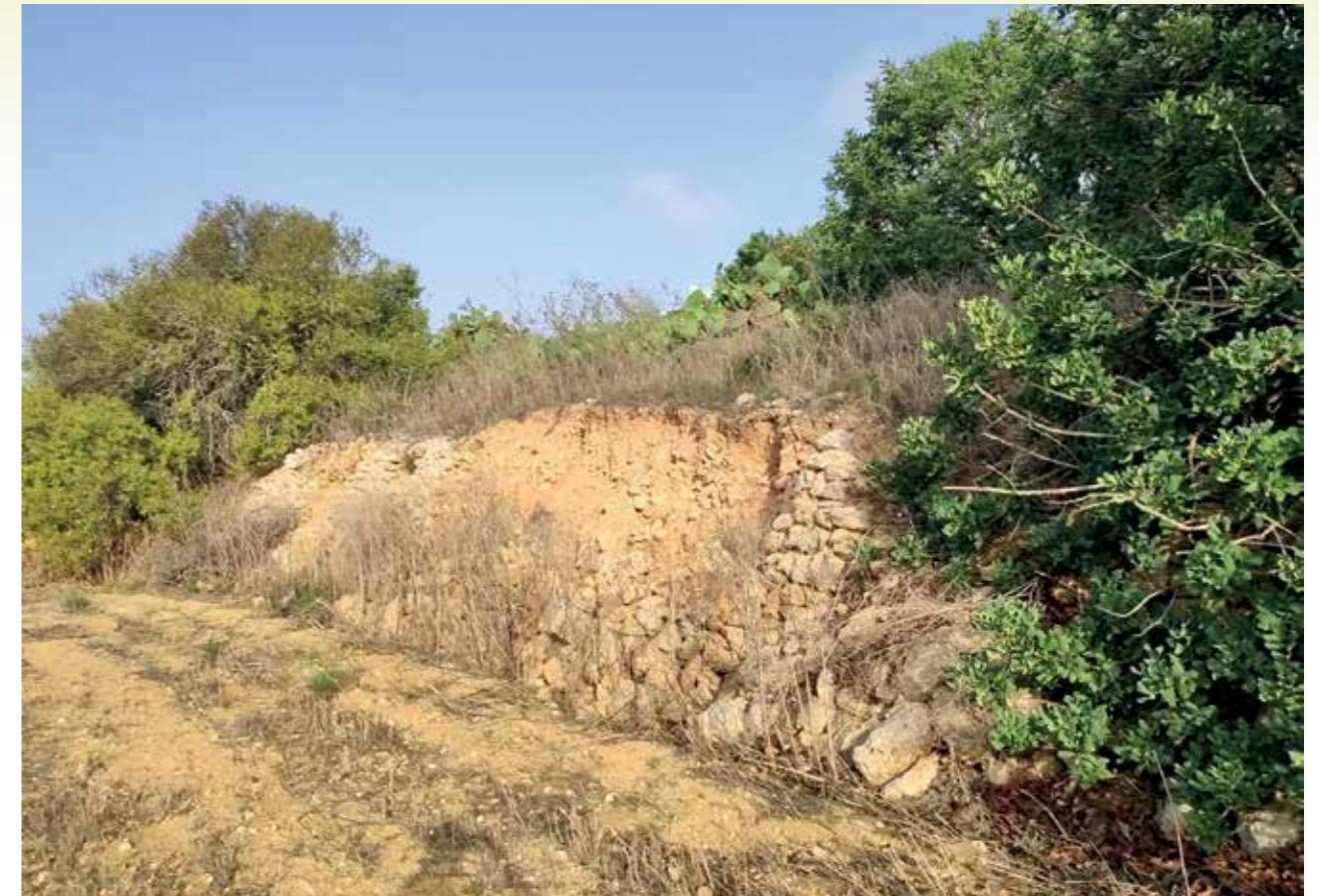
✘ Example of a soil retaining rubble wall that is not maintained which is leading to soil erosion

The list of protected and invasive trees can be found in Subsidiary Legislation number 549.123