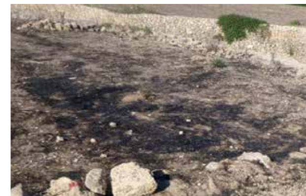
✗ Example of burning on the field (over 10 m 2 ).