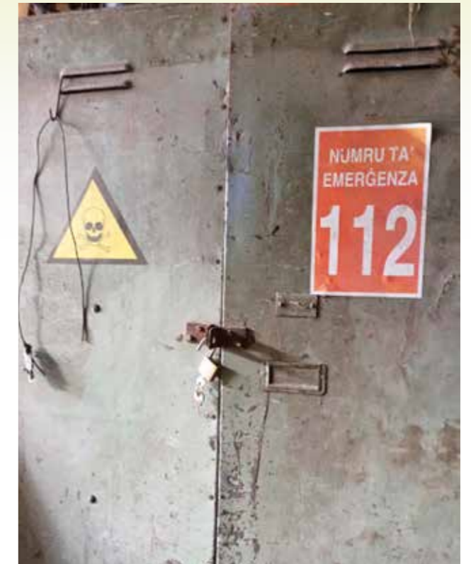
✓ Example of appropriate storage place for PPPs with limited access.